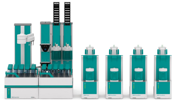
Figure 2. Sample Robot S with Dis-cover, OMNIS Dosing Modules and OMNIS Titrator Professional equipped with two dSolvotrodes.

on both work stations in parallel, acceptable results with low standard deviations are obtained. Results are summarized in Table 1 . An example titration curve is displayed in Figure 2 .