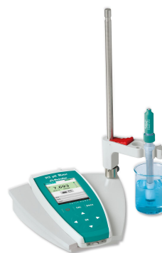
Figure 1. 913 pH Meter equipped with a pH electrode. Example setup for the determination of the pHe value.

A defined amount of sample is poured into a 100 mL beaker and placed on an external stirring plate. The EtOH Trode and the temperature sensor are immersed, and the measurement is started immediately. The value after 30 seconds is considered to be the acid strength of the sample.