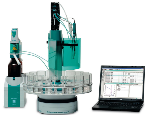
Figure 1. Titrand system consisting of an 815 Robotic USB Sample Processor XL in combination with a 907 Titrand.

No sample preparation is required for this analysis. For the analysis itself, approximately 100 mL tap water is needed for each application.