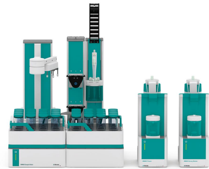
Figure 1. Fully automated OMNIS system for the determination of acid value in edible oils.

To a reasonable amount of sample, a solvent mixture consisting of ethanol and diethyl ether is automatically added, and the solution is stirred for one minute to dissolve the sample. Afterwards, the sample is titrated with standardized ethanolic KOH until after the equivalence point.