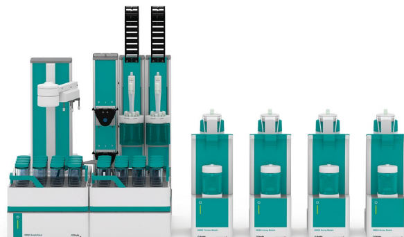
Figure 1. Example of an OMNIS system consisting of an OMNIS Sample Robot S with two working stations, an OMNIS Professional Titrator, and a corresponding amount of OMNIS Dosing Modules to add all necessary solutions.

An appropriate amount of sample is weighed into the titration beaker, then the beaker is covered with a lid and placed on the sample rack. Before the titration, glacial acetic acid, Wijs solution (ICl), and magnesium acetate solution are added and the solution is stirred for 5 minutes. Afterwards, potassium iodide solution is added and the solution is titrated with standardized sodium thiosulfate until after the equivalence point.