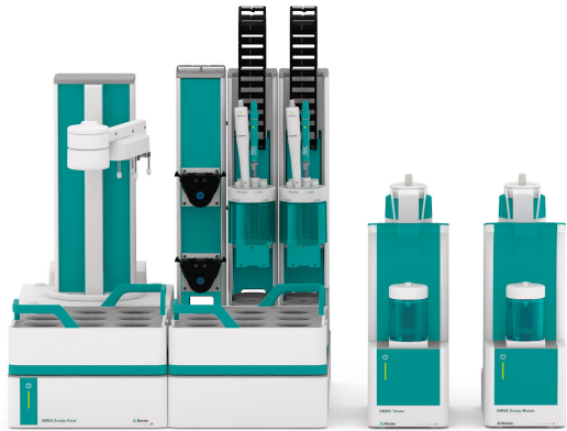
Figure 1. OMNIS Sample Robot S, OMNIS Dosing Module and OMNIS Advanced Titrator equipped with dProfitrode and dAg-Titrode for the determination of chloride content.

This analysis is carried out on an automated system consisting of an OMNIS Advanced Titrator and an OMNIS Sample Robot S equipped with a dProfitrode and a dAg-Titrode. Furthermore, a Polytron homogenizer is used for sample preparation. Water is added to a reasonable and representative amount of sample. The pH is adjusted with nitric acid to below pH 1.5. The sample is titrated with standardized silver nitrate until after the equivalence point is reached. For dip rinsing of electrodes and burets, first water, then isopropanol is used. Afterwards, the electrodes are conditioned in water for one minute before the next sample.