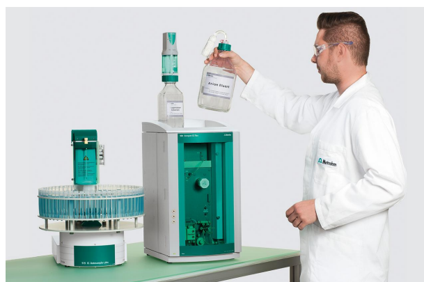
Figure 1. Compact, user-friendly Metrohm IC instrumentation to quantify various anions in explosives and explosion residues.

Sequential suppression, including chemical and CO 2 -suppression, reduces the background conductivity to around 1 µS/cm and vastly improves the signal-to-noise ratio. All anions are determined with a conductivity detector and quantified with the MagIC Net software.