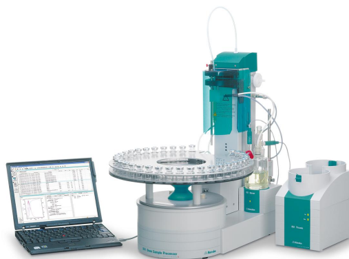
Figure 1. Fully automated system consisting of an 874 Oven Sample Processor with 851 Titrando for the coulometric Karl Fischer after vaporization of any moisture present in the sample.

The titration and the gas extraction of the sample is stopped as soon as the defined endpoint is reached and the drift (amount of water per time period) falls below a predefined value.