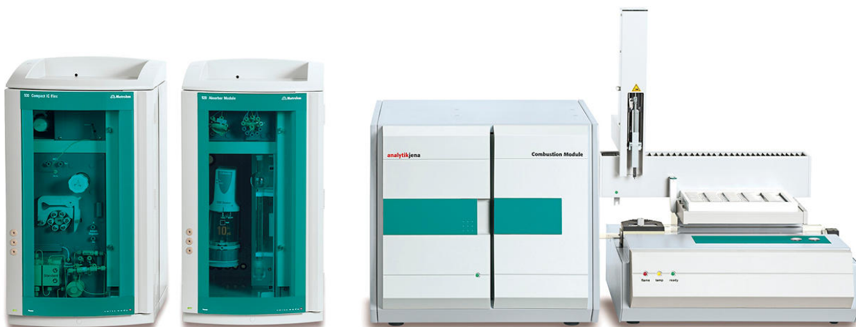
Figure 1. Combustion IC setup consisting of a 930 Compact IC flex (2.930.2560), a 920 Absorber Module (2.920.0010), a Combustion Module (Oven + ABD, 2.136.0700), and a MMS 5000 Autosampler (2.136.0800) configured for solid samples (6.7302.000).

an autosampler for solid samples, a combustion module, an absorber module, and an ion chromatograph (IC) (Figure 1).