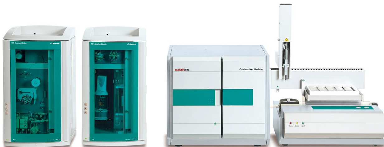
Figure 1. Combustion IC setup consisting of a 930 Compact IC flex (2.930.2560), a 920 Absorber Module (2.920.0010), a Combustion Module (Oven + ABD, 2.136.0700), and a MMS 5000 Autosampler (2.136.0800) configured for solid samples (6.7302.000).

an autosampler for solid samples, a combustion module, an absorber module, and an ion chromatograph (IC) (Figure 1).