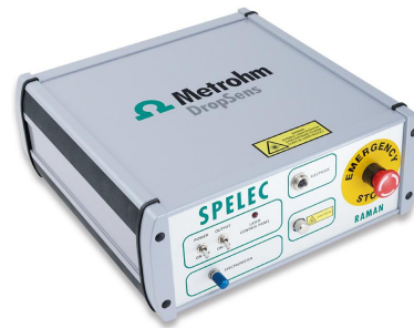
Figure 2. The SPELEC-RAMAN used for the measurements in the application note.

The fabulous, compact and integrated instrument for Raman Spectroelectrochemistry, SPELEC-RAMAN, was used for this Application Note. This instrument integrates in only one box: a spectrometer, a laser source (785 nm) and a bipotentiostat/galvanostat. Screen-printed electrodes (refs. DRP-110, DRP-110SWCNT, DRP-110CNT, DRP-110OMC, DRP-110GPH, DRP-110CNF) were placed in a specific cell for this type of devices (DRP-RAMANCELL) coupled with the DRP-RAMANPROBE, which allows to perform the Raman measurements of the electrode surface at optimal focal distance. Integration time was 20 s.