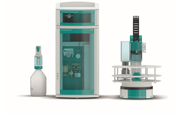
Figure 1. Instrumental setup including a 940 Professional IC Vario (center), 947 Professional UV/VIS Detector Vario SW (top center), 858 Professional Sample Processor (right), and MiPCT-ME, performed with the Metrosep A PCC 2 HC/4.0 and a Dosino (left).

The sample was analyzed with a chromatographic separation technique as described in USP <621> [3] (Figure 1). A MiPCT-ME setup was used in conjunction with the method parameters in Table 1. A 2 mL sample was preconcentrated on a Metrosep A PCC 2 HC/4.0, and the matrix was eliminated with 3 mL of ultrapure water. After injection, the anionic components were isocratically separated within 45 minutes on a Metrosep A Supp 10 - 250/4.0 column. The UV/VIS detector signal was recorded at 215 nm. Confirmation of the method accuracy was done with a spiking study. The sample was spiked with a nitrite standard at two concentration levels (1.0 g/L and 4 g/L), and the recovery values were evaluated.