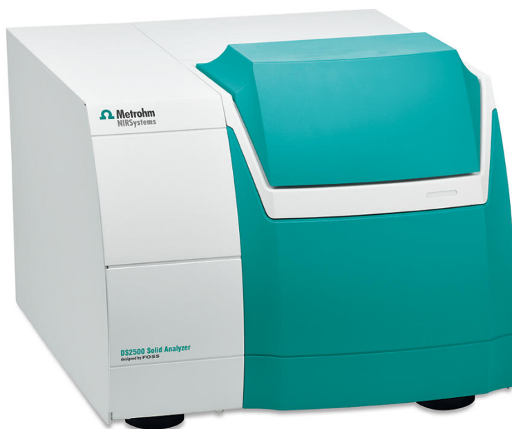
Figure 1. DS2500 Solid Analyzer.