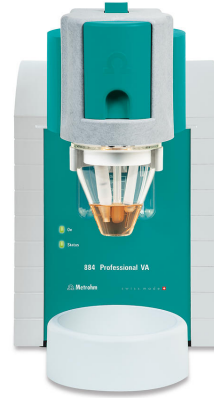
Figure 1. 884 Professional VA manual for MME.

The lfp sample is weighed, mixed with degassed diluted sulfuric acid, heated at 85 °C for 15 minutes, and then cooled. Afterward, the digested sample solution is added to the measuring vessel that contains 20 mL degassed electrolyte. Quantification is done using two standard additions with separate Fe(II) and Fe(III) solutions.