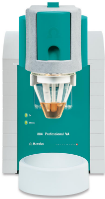
Figure 1. 884 Professional VA manual for MME

Add ultrapure water, the sample, and electrolyte solution into the measuring vessel and degas it for 5 min. Determination is carried out with the 884 Professional VA manual for MME ( Figure 1 ) using parameters listed in Table 1 . Quantification is done using two standard additions with respective standard addition solutions.