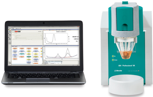
Figure 1. 884 Professional VA.

The concentration of Fe(II) is determined in iron sucrose injection solutions using polarography. Sodium acetate supporting electrolyte is deaerated for 5 minutes. Then the sample is added, and the polarogram is recorded using the parameters listed in Table 1.