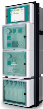
Figure 2. The 2060 TI Process Analyzer is suitable to monitor several critical parameters in nuclear pressurized water reactors.

Other process applications related to the water circuits of energy producers include silica, sodium, nickel, zinc, calcium, magnesium, and chloride. Reliable measurements of these critical parameters are possible with the 2060 TI Process Analyzer from Metrohm Process Analytics ( Figure 2 ).