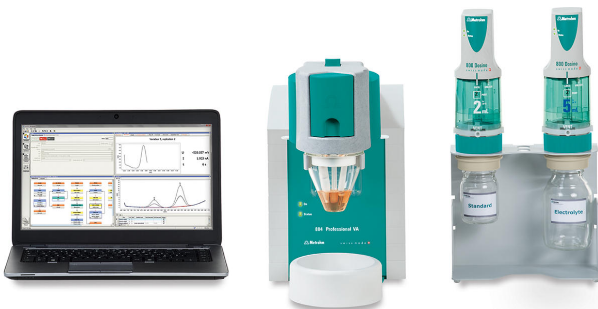
Figure 2. 884 Professional VA, semiautomated for VA analysis