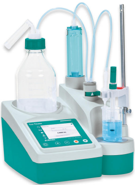
Figure 1. Eco Titrator equipped with a Unitrode with integrated Pt1000.

An appropriate amount of sample is pipetted into the titration beaker and then deionized water and sodium chloride are added. Afterwards, the solution is titrated until after the third endpoint with standardized sodium hydroxide.