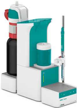
Figure 1. OMNIS Basic Titrator. Example setup for the determination of the pH value.

This analysis is performed on an OMNIS Basic Titrator equipped with a Profitrode and a temperature sensor. An aliquot of sample is pipetted into the sample beaker. While stirring, deionized water is added. After stirring for 1 minute, the pH value is measured until a stable drift is reached. Afterwards, the sensors are rinsed with deionized water for cleaning. The Profitrode is then conditioned for 2 minutes by immersing the glass membrane alone in deionized water.