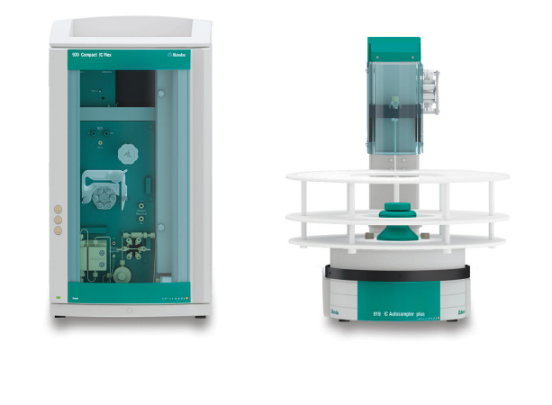
Figure 1. Instrumental setup including a 930 Compact IC Flex with IC Conductivity Detector and a 919 IC Autosampler plus.

monograph [1]. The solution was prepared by volumetric dilution of 1000 mg/L standard solutions of fluoride and chloride using micropipettes and 100 mL volumetric flasks. The quantification of the results was performed based on a single point calibration with a 1.1 g/mL fluoride standard.