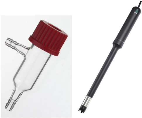
Figure 1. Used flow-through cell (left) and O2-Lumitrode (right).

This analysis is carried out on a 913 pH/DO Meter equipped with an O 2 -Lumitrode. The sensor is calibrated prior to the measurement. The sensor is inserted and fixed into a flow-through cell, where the inlet is connected to the outlet of the water supply.