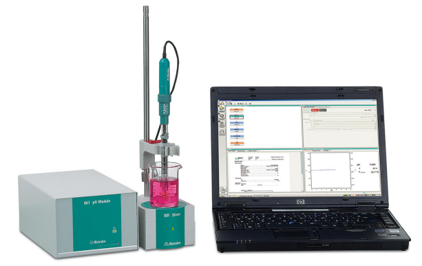
Figure 1. 867 pH Module for precise and reliable ion measurement after electrode calibration.

This analysis is carried out automatically on the 867 pH Module equipped with a bromide ion selective electrode, a reference electrode, and a temperature sensor. The ISE is calibrated prior to the analysis. Ionic strength adjustor is added to the sample to fix the ionic strength. To homogenize the mixture, it is stirred for 1 minute. Afterwards, the sensors are placed into the sample and the bromide concentration is measured.