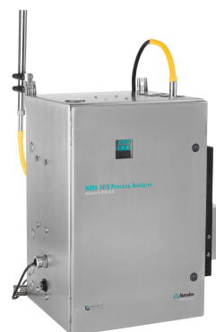
Figure 2. NIRS XDS Process Analyzer from Metrohm Process Analytics.

Wavelength range used: 1100–1650 nm. Inline analysis is possible using a micro interactance reflectance probe with purge on collection tip directly in the fluid bed dryer.