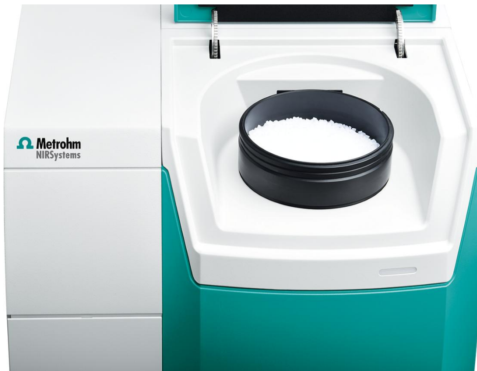
Figure 1. Metrohm DS2500 Solid Analyzer with the DS2500 large sample cup for measuring the intrinsic viscosity of recycled polyethylene terephthalate (rPET).

spectra. This setup with the large sample cup reduces the influence of the particle size distribution of the polymer pellets ( Figure 1 ). Data acquisition and prediction model development was performed with the software package Vision Air Complete.