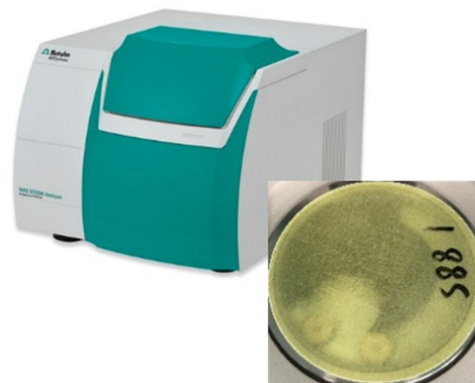
Figure 1. DS2500 Solid Analyzer and a polymer sheet resin.

520 spectra of samples were collected using a Metrohm DS2500 Solid Analyzer and the Vision Air Complete spectroscopy software. The laboratory values for the transition time were determined by melting the samples, and values between 60 and 126 seconds were obtained. The data set consisting of spectra and lab values was split into a calibration and validation set (1:1). Outlier detection was performed on pre-processed spectra (2 nd derivative and SNV) using a maximum distance algorithm. The NIR prediction model was created with the equipment described in Table 1 and validated using the validation set.