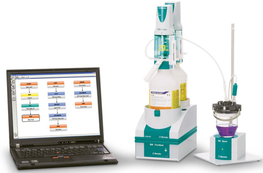
Figure 1. 859 Titrotherm with tiamo. Example setup for the thermometric titration of ferrous iron.

An aliquot of sample is weighed directly into the titration vessel. Both the spike solution (ferric ammonium sulfate, FAS) to improve the detection of the endpoint and diluted sulfuric acid solution are dosed to the sample. The mixture is then made up to a total volume of approximately 30 mL with deionized water. The sample is titrated with standardized ceric ammonium nitrate until after the exothermic endpoint.