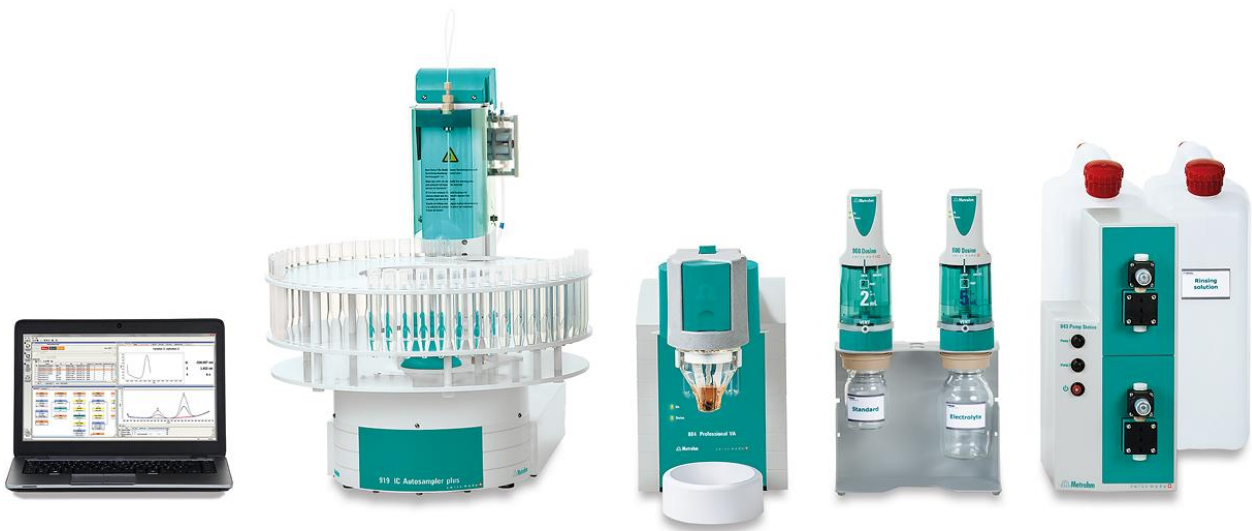
Figure 2. 884 Professional VA fully automated for VA analysis