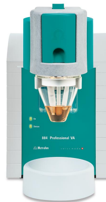
Figure 1. 884 Professional VA manual for MME.

Add 10 mL oxidized sodium chloride brine sample and 2 mL of ultrapure water into the measuring vessel. The determination of iodide is carried out with the 884 Professional VA (Figure 1) using the parameters specified in Table 1. The concentration is determined by two additions of iodate standard addition solution.