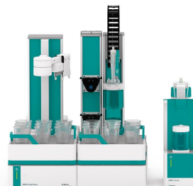
Figure 1. OMNIS system consisting of an OMNIS Sample Robot S and an OMNIS Advanced Titrator equipped with a Profitrode for the determination of the reserve alkalinity in engine coolant.

Afterwards, the solution is aspirated and the buret tips as well as the electrode are rinsed with deionized water. The glass membrane of the electrode alone is then conditioned for 2 minutes in deionized water.