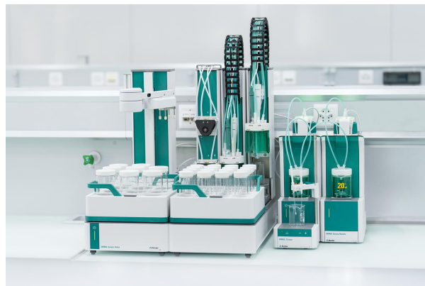
Figure 1. OMNIS Sample Robot S equipped with an OMNIS Titrator, OMNIS Dosing Module, and dSolvotrode for the automated determination of TAN and TBN in motor oil samples.

One exemplary titration curve of TBN with \text{HClO}_4 is shown in Figure 2.