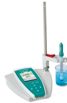
Figure 1. 913 pH Meter equipped with a pH electrode. Example setup for the determination of the pHe value.

A defined amount of sample is poured into a 100 mL beaker and placed on an external stirring plate. The EtOH Trode and the temperature sensor are immersed, and the measurement is started immediately. The value after 30 seconds is considered to be the acid strength of the sample.