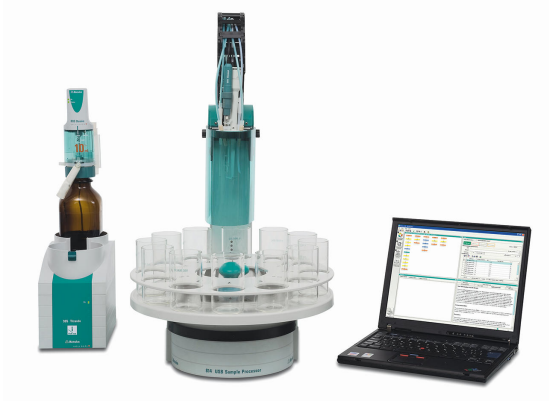
Figure 1. Titration system consisting of an 814 USB Sample Changer in combination with a 907 Titrand and tiamo.

The blank is determined in the same way, but by omitting the sample.