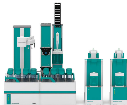
Figure 1. Sample Robot and OMNIS Titrator Advanced equipped with a Solvotrode easyClean for the determination of the base number of lubricating oil and motor oil.

After each sample determination, the electrode needs to be rinsed with solvent solution, then isopropyl alcohol (IPA) followed by water. To rehydrate the glass membrane of the electrode, the glass membrane is placed into deionized water.