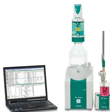
Figure 1. 907 Titrando with tiemo. Example setup for the photometric determination of vitamin C.

An aliquot of the prepared sample is added to the titration beaker, followed by oxalic acid. Then, the solution is titrated using standardized 2,6-Dichlorophenol-Indophenol (DPIP) until after the first equivalence point.