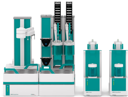
Figure 1. OMNIS Sample Robot S, OMNIS Dosing Module and OMNIS Advanced Titrator equipped with dProfitrode and dAg-Titrode for the determination of chloride content.

This analysis is carried out on an automated system consisting of an OMNIS Advanced Titrator and an OMNIS Sample Robot S equipped with a dProfitrode and a dAg-Titrode. Furthermore, a Polytron homogenizer is used for sample preparation. Water is added to a reasonable and representative amount of sample. The pH is adjusted with nitric acid to below pH 1.5. The sample is titrated with standardized silver nitrate until after the equivalence point is reached. For dip rinsing of electrodes and burets, first water, then isopropanol is used. Afterwards, the electrodes are conditioned in water for one minute before the next sample.