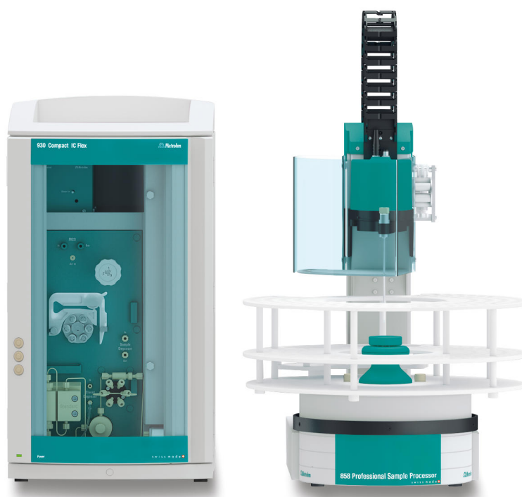
Figure 1. Instrumental setup including a 930 Compact IC Flex Oven/SeS/PP and an 858 Professional Sample Processor.