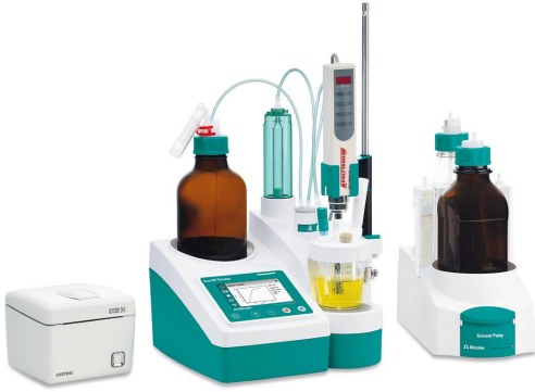
Figure 1. Eco KF Titrator equipped with a Polytron, a Solvent Pump, and a double Pt-wire electrode for volumetric Karl-Fischer titration.

An appropriate volume of sample is injected into the sample beaker and the sample size is weighed back. Alternatively, the sample can also be weighed in directly. However, the solution is homogenized with the Polytron and titrated with standardized Karl Fischer titrant to the endpoint.