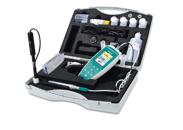
Figure 1. Transport case including all accessories and a 914 pH/DO/Conductometer equipped with an O 2 -Lumitrode and conductivity sensor for the determination of dissolved oxygen in a freshwater stream.

This analysis is carried out on a 914 pH/DO/Conductometer equipped with an O 2 -Lumitrode and a conductivity measuring cell to compensate for the higher salinity. Both sensors are calibrated before the measurement. The sensors are both directly inserted into the surface water at the point of interest, to a depth of at least 3.5 cm.