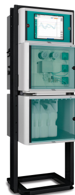
Figure 3. 2060 VA Process Analyzer from Metrohm Process Analytics.

Employing voltammetric determination, the 2060 VA Process Analyzer (Figure 3) operates fully automatically. It also features an alarm system that notifies plant personnel when any of the monitored heavy metals approach the limit values. This timely alert enables the introduction of ion exchanger regeneration or other strategies for mitigation, effectively preventing limit value breaches.