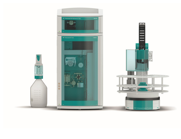
Figure 1. Instrumental setup including a 940 Professional IC Vario (center), 947 Professional UV/VIS Detector Vario SW (top center), 858 Professional Sample Processor (right), and MiPCT-ME, performed with the Metrosep A PCC 2 HC/4.0 and a Dosino (left).

Anionic components were isocratically separated on a Metrosep A Supp 10 - 250/4.0 column and the background was reduced to a minimum with sequential suppression. The UV/VIS detector signal at 215 nm was recorded. The total run time was 40 minutes. The method accuracy was confirmed by a study where samples were spiked with 4 µg/L NO 2 - and the recovery values were evaluated.