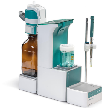
Figure 1. OMNIS Professional Titrator equipped with a dUnitrode with integrated Pt1000.

The samples are homogenized according to their dosage form (e.g., tablets are crushed, gels are shaken, etc.) and dissolved in carbon dioxide-free water.