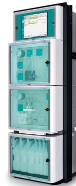
Figure 2. 2060 Process Analyzer for photometric measurements of ultratrace iron and copper in the water-steam circuit of power plants.

and money until the next scheduled maintenance period. Corrosion Product Sampling (CPS) is a key metric in the cycle chemistry performance monitoring, as corrosion can occur at any time given the continuous contact between metal parts and water. Maintaining a good cycle chemistry program is much easier and less costly than taking corrective actions as a result of an inadequate program.