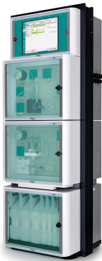
Figure 2. The 2060 TI Process Analyzer is suitable to monitor several critical parameters in nuclear pressurized water reactors.

Other process applications related to the water circuits of energy producers include silica, sodium, nickel, zinc, calcium, magnesium, and chloride. Reliable measurements of these critical parameters are possible with the 2060 TI Process Analyzer from Metrohm Process Analytics ( Figure 2 ).