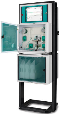
Figure 3. 2060 XRF Process Analyzer.

Incorporating both analysis techniques (i.e., titration/photometry and XRF) in the 2060 XRF Process Analyzer offers users a comprehensive solution for monitoring cyanide levels and metal concentrations in the gold recovery process. This integration enhances plant safety, ensures full recoveries of cyanide from complex solutions, and accelerates return on investment (ROI) by consolidating both methods into one analyzer, thereby reducing footprint and operational costs.