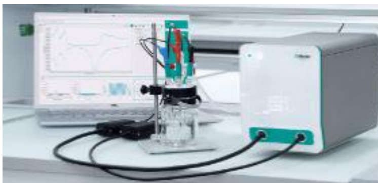
Figure 1. VIONIC powered by INTELLO.

The hydrogen permeation experiment was conducted with two VIONIC powered by INTELLO instruments from Metrohm Autolab (Figure 1).