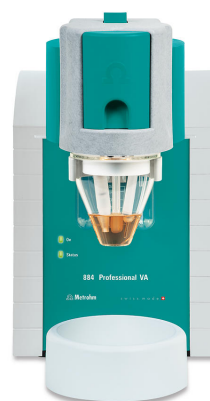
Figure 1. 884 Professional VA manual for MME.

Add 10 mL acetic acid sample and then 2 mL ultrapure water into the measuring vessel. Carry out the determination of iodide using the 884 Professional VA (Figure 1) and the parameters specified in Table 1. The concentration is determined by two additions of iodide standard addition solution.