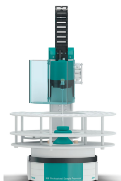
858 Professional Sample Processor – Pump 858 - 500 L500 mL2800