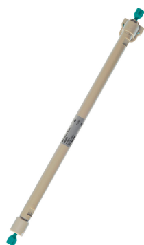
Metrosep A Supp 7 - 250/4.0 ( ) ( EPA 300.1 Part BEPA 317.0EPA 326.0 ) Metrosep A Supp 7 - 250/4.0 g/L 5-m