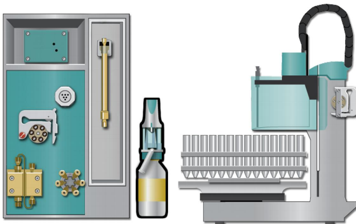
Figure 2. Compact instrumentation to quantify carbonate in sodium hydroxide: Compact IC Flex with a Dosino for MiPT and a 858 Professional Sample Processor.