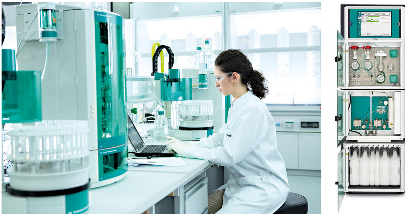
Figure 2. Ion chromatographs for laboratories (left) and for process analytics (right).

Internal reference: AW IC CH6-1210-102014