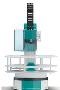
858 Professional Sample Processor – Pump 858 - 500 L500 mL2800