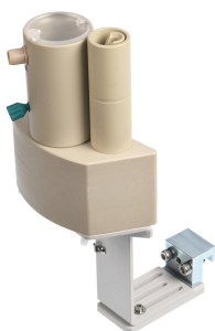
Liquid Handling Station Swing Head