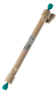
Metrosep C 6 - 150/4.0 C 6 Metrosep C 6 - 150/4.0