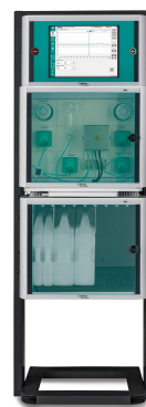
Figure 3. 2060 XRF Process Analyzer for the analysis of CTZ content in white bronze baths.

While XRF enables fast and accurate analysis of total metal content, voltammetry (VA) offers the added advantage of distinguishing free \text{Cu}^{2+} , \text{Zn}^{2+} , and \text{Sn}^{2+} ions, rather than measuring only their total concentrations. Distinguishing between these species is particularly important for monitoring the \text{Sn(II)}/\text{Sn(IV)} balance which is crucial for bath stability and plating performance. It also ensures that metal ion availability supports optimal deposition rates and bath efficiency.